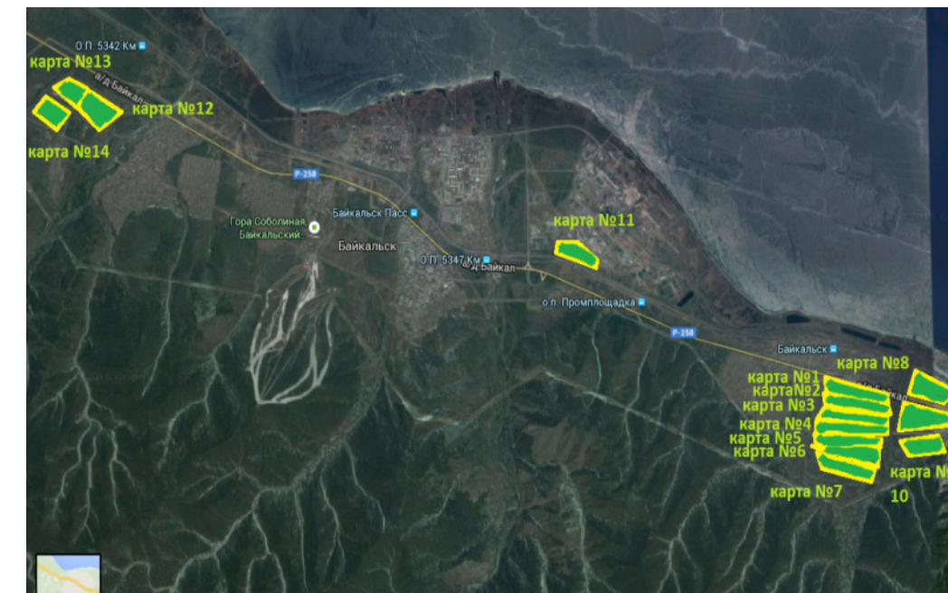
Fig. 1. Location of Baikalsk Pulp and Paper Mill storage pits

In the samples collected in the observation wells of water intake, the concentration of the substances mentioned below exceeds MAC for fishery water: formaldehyde up to 1.3-2.9 MAC, petroleum products up to 6.2 MAC, aluminum 3.2-19.7 MAC, iron up to 8.9 MAC [3, p. 192-193]. The obtained data on the environmental conditions do not significantly differ from that obtained 5 years ago (average deviation does not exceed 5-8%). The analysis of plant samples (needles of Siberian pine ( Pinussibirica Du Tour)) collected within the study area revealed that the concentration of heavy metals does not exceed the normative values.